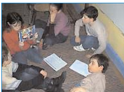
Activities based on the fairy tale "Cl@r@ in the land of the Internet" with 8-12 year-olds in Mouscron (Belgium)