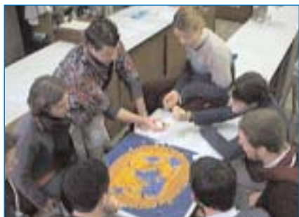
A game of "Race on the Web" for 15-18 year-olds in Hannut (Belgium)

On the whole, the experimenters chose activities dedicated to exploring the Internet. In this domain, two games that aim at discovering the Internet and two activities are particularly successful among the youth :