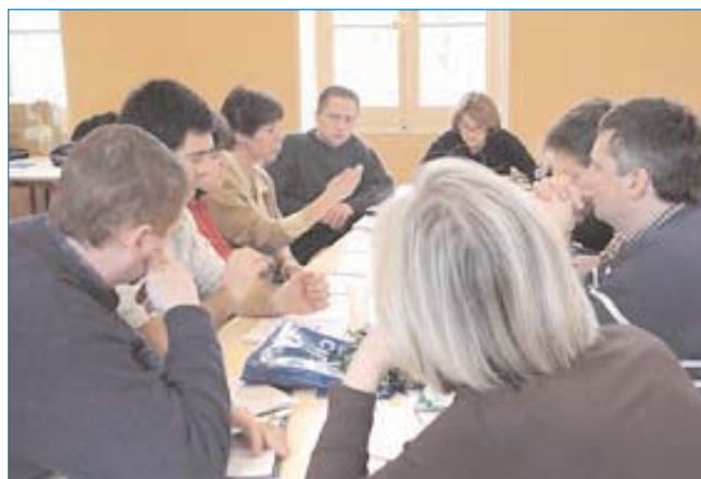
“Think-tank” meeting during the February 2002 conference in Aix-en-Provence

Initially, it appeared necessary to differentiate the dangers in relation to the age-group of the audiences involved (8-11, 12-15, 16-18). Despite this distinction, however, on observation was finally imposed: it would seem that there is very little difference between the risks perceived by the 3 age-groups. The experimenters perceive and identify the same type of dangers regardless of the age of their audiences.