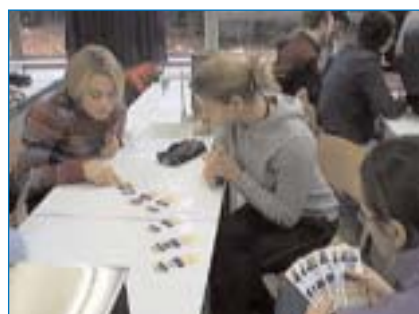
12-15 year-olds discovering "Dominonet" in Hannut (Belgium)

A large number of these activities have been put together in a "cybercarnet" (cybernotebook), which is part of a Cyberkit that had a huge success with youth: 1600 copies were published and distributed during the first two experimentation phases.